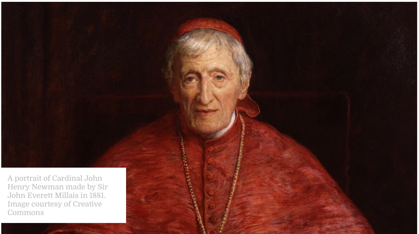
A portrait of Cardinal John Henry Newman made by Sir John Everett Millais in 1881.

(RNS) — On Sunday (Oct. 13), Pope Francis will canonize Cardinal John Newman, the first Englishman to be made a saint since Pope Paul VI canonized the Forty Martyrs of England and Wales, who were killed for their Catholic faith during the Protestant Reformation.